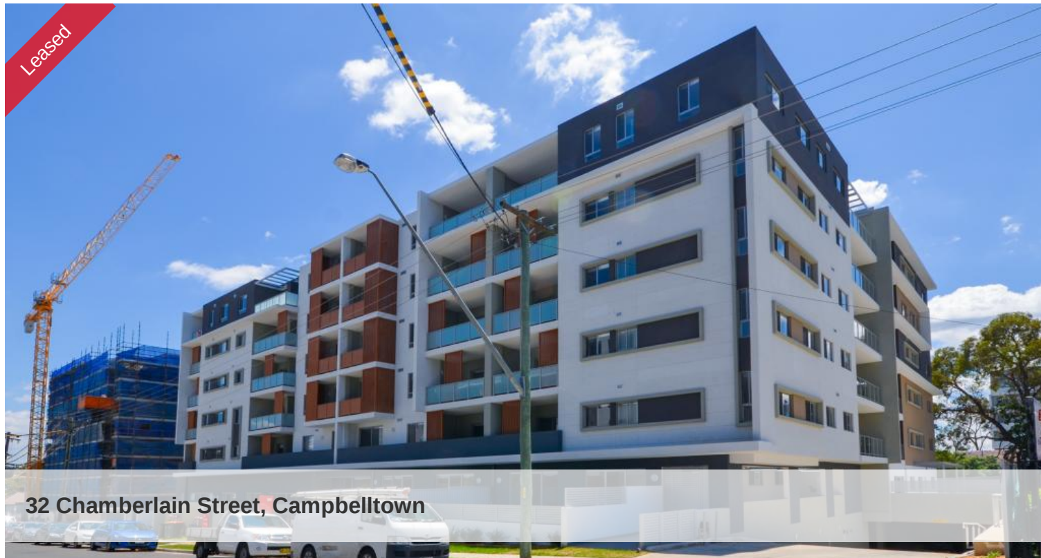
32 Chamberlain Street, Campbelltown